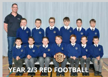
YEAR 2/3 RED FOOTBALL